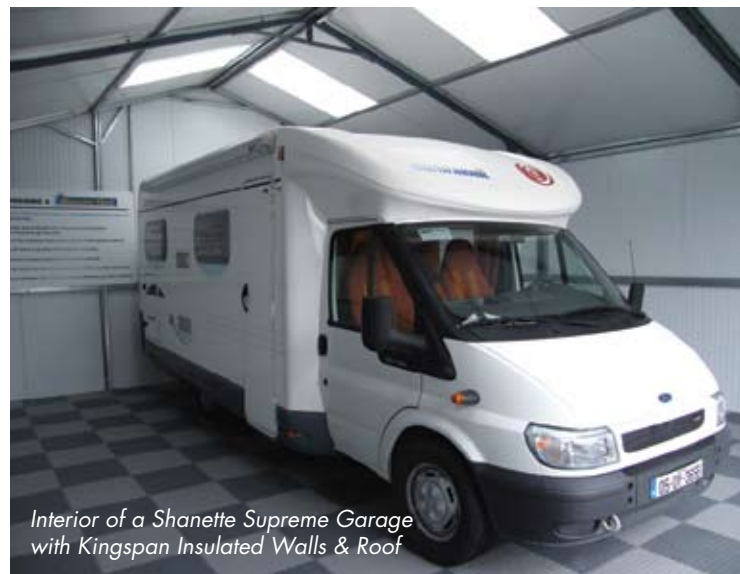
Interior of a Shanette Supreme Garage with Kingspan Insulated Walls & Roof